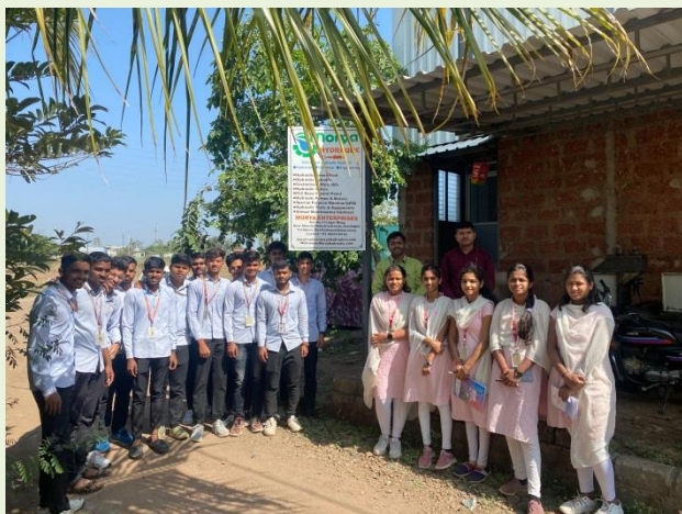
Visit to Morya Industries