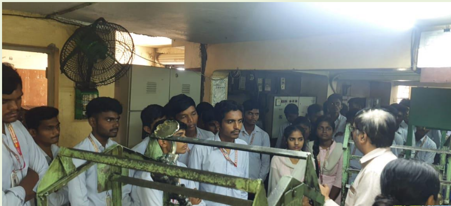
Visit to Seco Tools Pvt. Ltd.