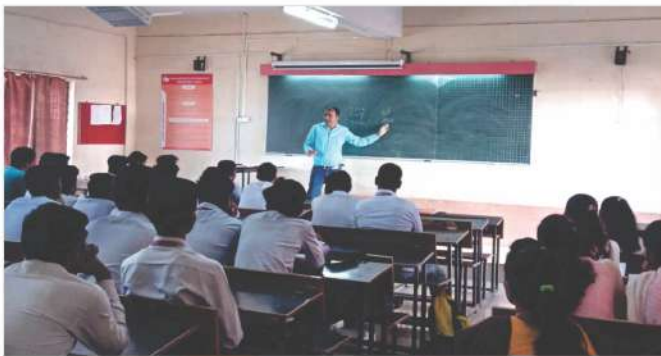
COMPETITIVE EXAM GUIDANCE - RTO

To aware the Students about Current Industry Scenario which will help them to be prepared for there further career, We have conducted guest lectures with the help of eminent personalities from various industries and institutes.