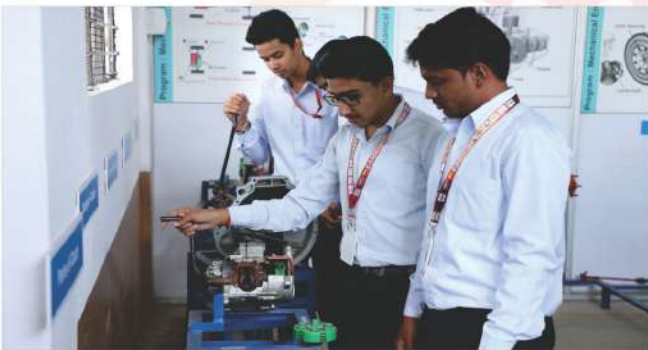
AUTO MOBILE ENGINEERING LAB