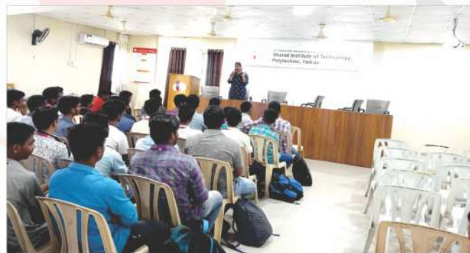
SOFT SKILL DEVELOPMENT