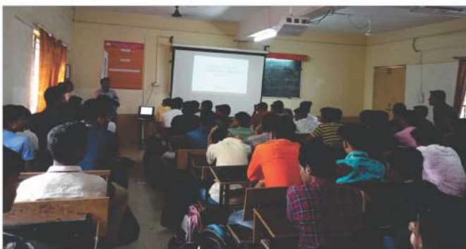
JIG AND FIXTURE DESIGN