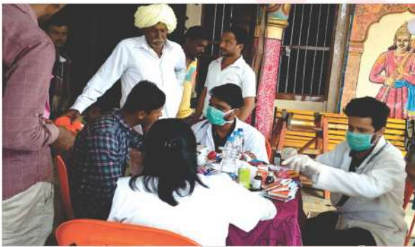
MEDICAL CAMP IN FLOOD AFFECTED PEOPLE

It is to provide opportunities for students to pursue their personal, professional and academic goals in student-led organization. To exchange their educational experience students are encouraged to participate in group activities that allow them to develop personal and professional relationships, learn leadership and organizational skills and serve the community.