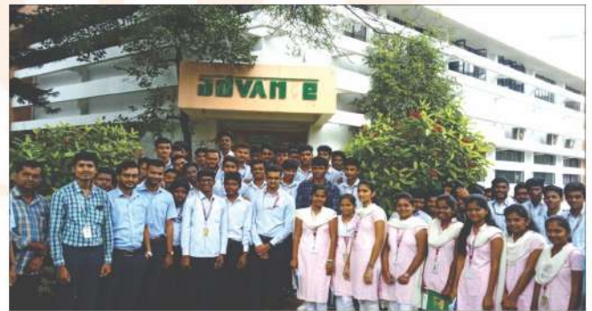
ADVANCED MEASURING SYSTEM