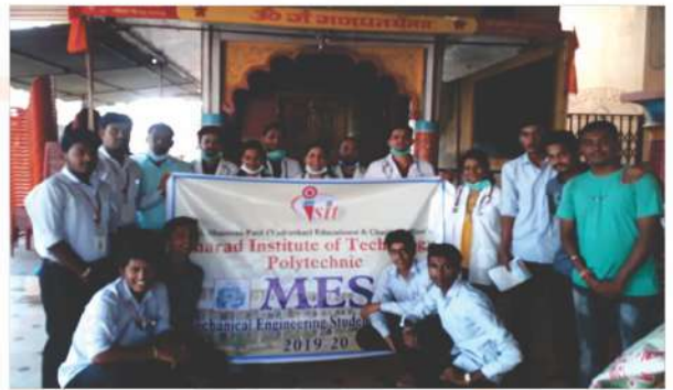
MEDICAL CAMP IN FLOOD AFFECTED PEOPLE