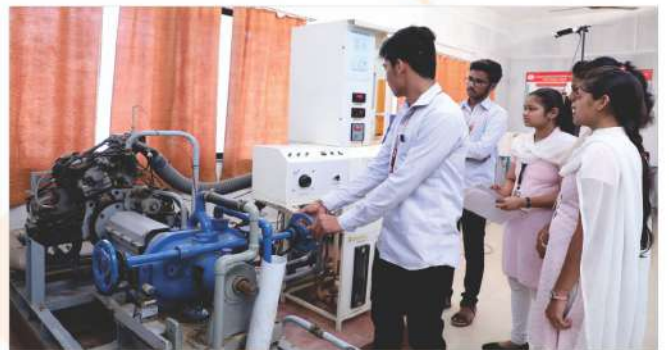
POWER ENGINEERING LAB