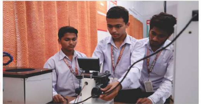
MECHANICAL ENGINEERING MATERIALS LAB